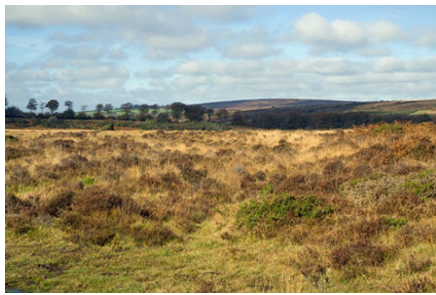
Towards Winsford Hill

ring the bell on the conservatory for service). Returning across the iron bridge, turn right over a small stone bridge, cross the road ahead of you and head briefly uphill on a slip-road before crossing a second road to join a stony track towards Court Down and Northcombe. This heads steeply uphill, but in under two minutes turn sharply right on a more level track. In about five minutes this arrives at a road, the B3223 into Dulverton; turn left here, looking out for traffic. This is perhaps the prettiest route into Dulverton, with houses nestling under the cliffs on the left, and the river and then the mill stream on the right. When you come to a house on the right with three windows facing you above each other, cross the stream and turn immediately left on a narrow path to follow it back to the car park and town centre.