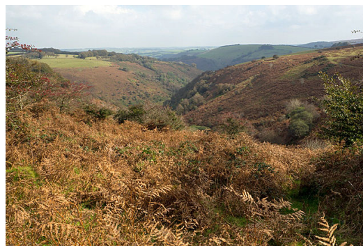
East from Road Hill

join another bridleway in front of the tree stump, keeping right. Go through a gate, followed by two lines of beech trees. After the second line of trees the path starts descending; turn left through a gate signposted to Exford (3hr15mins, [8]). You have a panoramic view over Exford and beyond before the path goes through a gate into a small wood. The well-defined path now continues downhill towards Exford, eventually becoming a vehicle track and passing between houses. Where it comes to a junction (3hr30mins, [9]) turn right ('footpath to Exford and Winsford'), then immediately turn left over a bridge. On the far side of the bridge turn left, and follow the river to the car park and the attractive village of Exford (3hr40mins).