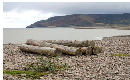
From Porlock Weir

near the end of a row of houses, turn right and head down into Porlock Weir. Your onward route is to the right, but first turn left and explore the village and harbour (50mins, [2]).